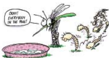
UNUSED POOLS ARE OFTEN GREAT BREEDING SITES FOR MOSQUITOES

Empty water out of buckets, old tires, flower pots and toys.