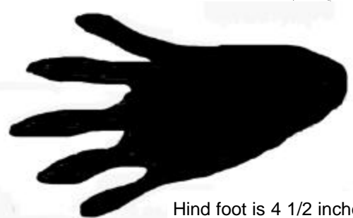
Hind foot is 4 1/2 inches

Because they will eat just about anything, raccoons almost never starve.